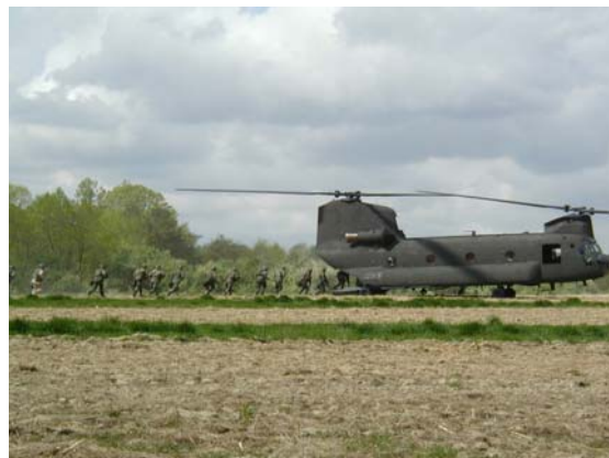
CH-46 to medivac injured soldiers from IED attach on convoy.

Rajant Corporation www.rajant.com 400 E. King Street Malvern, PA 19355 Phone 484-595-0233 Fax 484-55-0244