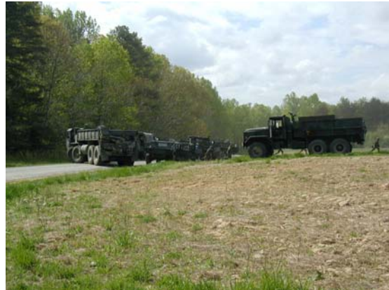
Convoy Box formation in clear and safe environment after enemy engagement to make needs assessment and damage report.

The Situational Training Exercise was deemed a success and Rajant Corporation is proud to take part in such an important solution for our military.